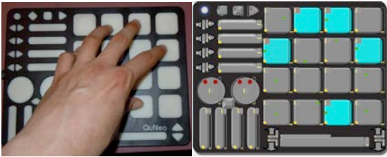
Figure 2. QuNeo and its Simulation

tions substitute for device interactions. Our focus with these simulations is to expressively manifest the gestures in a visual mode that complements and is parallel to the lexical representation in OSC.